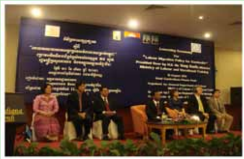
Launch of Labour Migration Policy, Cambodia

The challenges in migration governance include the development of sound labour migration policies, a strong legal framework and effective management of labour migration based on international instruments and social dialogue. In the past four years, through the direct support of the ILO/Japan Project, numerous labour migration-related policies have changed for the better.