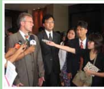
Joint efforts of UN system, government and civil society, Thailand