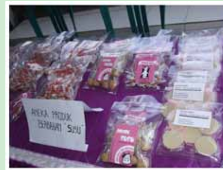
Products from Cooperatives in East Java