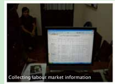
Collecting labour market information