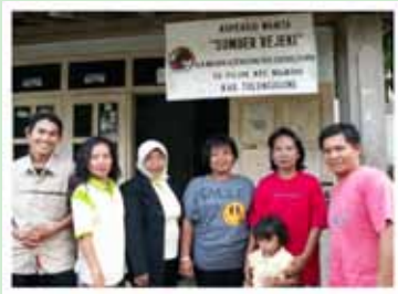
▲ Cooperatives in East Java

Remittances affect countries of origin at both household and national levels. Remittances increase the purchasing power of households, enabling them to spend more on daily consumption, health, education and debt servicing. Investment of remittances to establish a family or collective business is significant empowerment for migrant workers; it enables individuals and their communities to build an economic foundation and thus decrease their dependence on remittances and the pressure for migration.