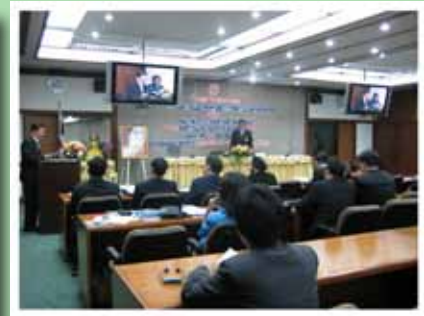
Engagement with lawmakers in Thailand