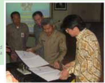
Signing MOU between law enforcers and recruitment agency association in East Java