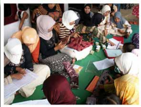
Cooperative operation in East Java, Indonesia

With training provided through the project, the women members honed their management and entrepreneurial skills, learned how to start a business and operate the cooperative better. Today, each cooperative offers a range of products – from food and agricultural goods to fertilizers and microcredit. The available credit is used for health care and education expenses as well as income-generating activities. The cooperatives have generated economic activity and created jobs for non-migrant women in their villages. They also have become a source of information on safe migration for potential migrant workers and provide assistance to workers returning from abroad.