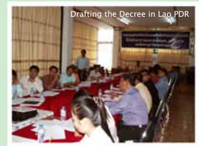
Drafting the Decree in Lao PDR