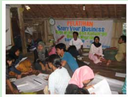
▲ Entrepreneurship development in East Java, Indonesia

The ILO/Japan Project encouraged the productive investment of remittances as a way of maximizing the outcomes of migration for migrant workers and their families, as well as for the national economy.