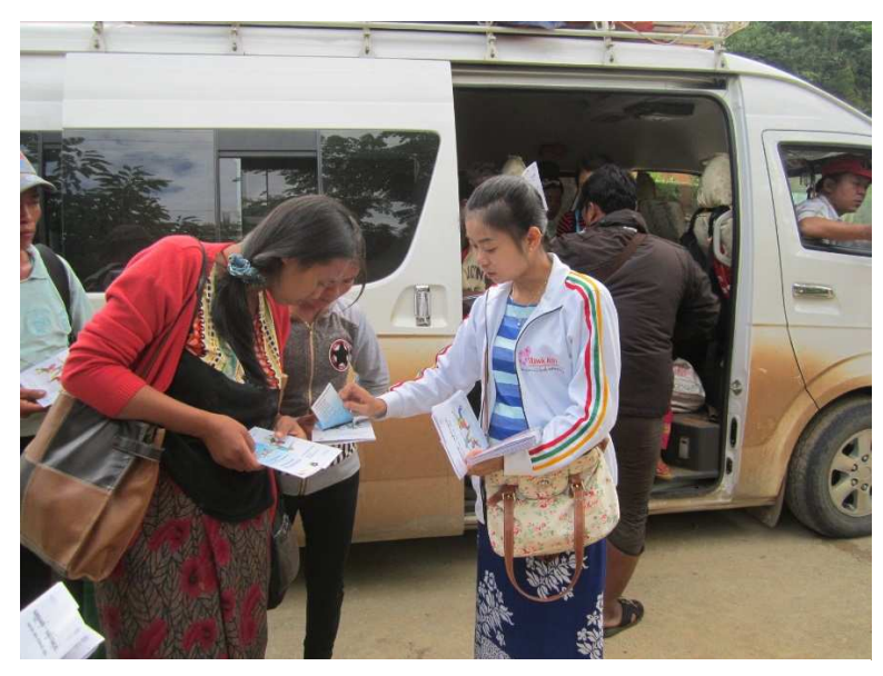
MRC staff distribute information on safe migration at a bus station in Shan State, Myanmar.

A strong emphasis has been placed on achieving gender balance among beneficiaries of support services to ensure the project contributes to equitable outcomes. Notable progress in reaching women migrants was made during the period, with a year-on-year increase of five per cent in women migrants served by MRCs. In particular, service provision to women migrants in Myanmar improved substantially, supported by collaboration with gender specialized partners such as the Tavoyan Women's Union and the establishment of CSO networks in Yangon and Kyaing Tung to work more closely with women's groups.