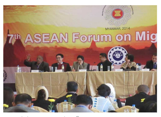
Panel discussion at the 7^{th} ASEAN Forum on Migrant Labour held in Nay Pyi Taw, Myanmar.