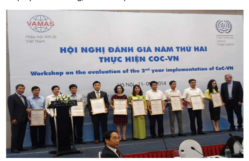
Workshop to evaluate the implementation of the VAMAS Code of Conduct in Hanoi, Vietnam.

GMS TRIANGLE supported the Malaysian Employers' Federation (MEF) to carry out a study of the recruitment and employment of migrant workers by its membership. Survey responses from 101 firms were collected in order to draft Practical Guidelines for Employers on the Recruitment, Placement, Employment and Repatriation of Foreign Workers in Malaysia . To date, the Guidelines have been used as the basis for training over 200 employers in Penang, Kuala Lumpur and Johor.