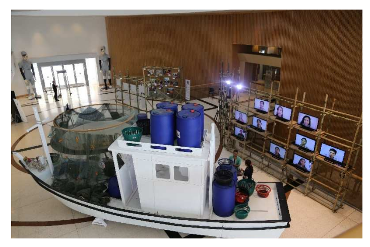
Fishing installation at the Bangkok Art and Cultural Centre to mark International Migrants Day

With the support of GMS TRIANGLE, the system used to resolve grievances in Cambodia has become a model of good practice for such mechanisms. To facilitate greater access for migrant workers, local labour authorities and MRCs conduct outreach and offer initial assistance. If the complaints cannot be resolved with provincial assistance, referrals are made to the Ministry of Labour and Vocational Training or specialized legal assistance providers in Phnom Penh. Through capacity building of the relevant authorities, it is hoped that complaint mechanisms for migrants in other countries of origin may follow a similar course in the coming years.