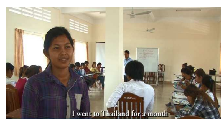
Screen shot of a TV spot developed by the Migrant Worker Resource Centre in Battambang, Cambodia

After three years of operation, end-line surveys to assess the impact of MRC activities were conducted in Cambodia and Viet Nam during March and April 2015. The findings indicate that MRC activities have helped to fill several major gaps in awareness among potential migrants, contributing to a reduction in vulnerability to exploitation and abuse during the labour migration process. Though the results were highly positive, the endemic nature of these problems were also very evident, suggesting that sustained intervention is needed.