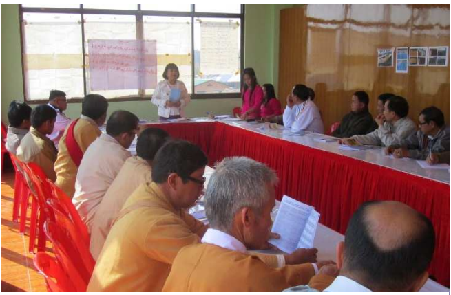
Meeting of the Civil Society Network for Migrants in Kyaing Tung, Myanmar.

The project has supported increased cooperation and coordination among civil society and international organizations in all six countries. In Lao PDR, the project supported the establishment of the Labour Migration Network Meeting, the first forum to bring together government and civil society to discuss labour migration governance. GMS TRIANGLE also continued its long-term support of the 'Forum to Address Labour Migration and Trafficking' in Cambodia and national and subnational civil society networks have been established with ILO assistance in Myanmar.