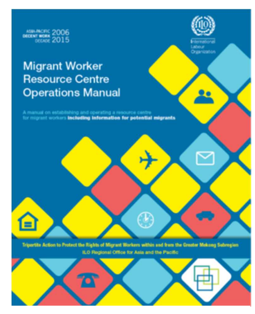
Cover of the Migrant Worker Resource Centre Operations Manual.

Following extensive consultation with government and social partners, pre-departure training curricula have been finalized for Cambodia, Viet Nam, Lao PDR and Myanmar and training of trainer events organized. Further discussions on the roll-out of the curricula and the most effective delivery mechanisms remain on-going. In Cambodia, the Association of Cambodian Recruitment Agencies (ACRA) has begun delivering this training for workers. In Myanmar, copies have been distributed to government and social partners and have been used to train staff from four Labour Exchange Offices in the Mandalay region.