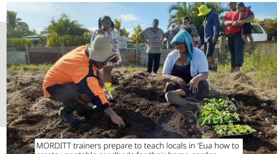
MORDITT trainers prepare to teach locals in 'Eua how to create vegetable seedbeds for their home garden

Through the Informal Economies Recovery Project, IFAD is supporting a range of agricultural development activities across Tonga, including supporting the investment in seedlings for homestead gardens to improve food security. Read More