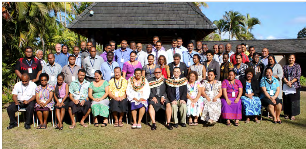
Participants of the ILO / ITC sub-regional skills and livelihoods training programme for older out of school children in or at risk of child labour

Participants from Fiji, Kiribati, Papua New Guinea, Samoa, Solomon Islands, Tuvalu and Vanuatu have gained a better understanding of the key issues that require attention in the planning and delivery of skills and livelihoods training programmes for older out of school children in or at risk of child labour.