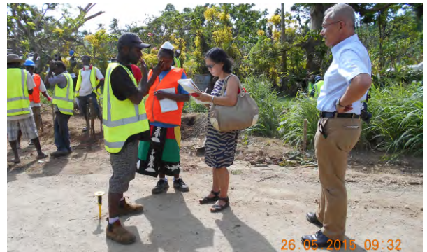
Japanese government/donor representatives in Vanuatu visit LBT field training site and had positive feedback about their assessment.