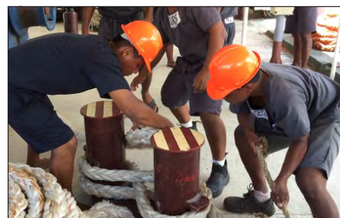
Kiribati Maritime Training Center