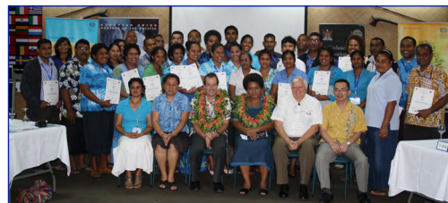
Participants at the Know About Business (KAB) Training of Trainers in Suva, Fiji.