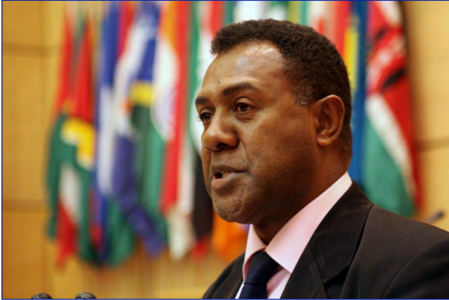
Mr. Lionel Kaluat, Commissioner of Labour, Vanuatu Department of Labour addresses the conference in 2011. Geneva, Switzerland.

Prior to participating in the Conference the ILO Office covering all the Pacific Island Countries, offers tripartite delegations briefings on the administrative matters concerning how the Conference is run and on the technical items on the agenda.