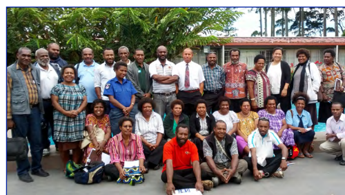
Child labour road-show participants in Mt. Hagen, Papua New Guinea.