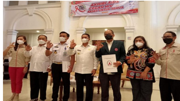
The ILO joins hands with the Confederation of Indonesian Moslem Trade Union (K-Saburmusi) and the City Government of Sukabumi to prevent the spread of HIV and COVID-19 for transportation workers and people with HIV (September 2021).