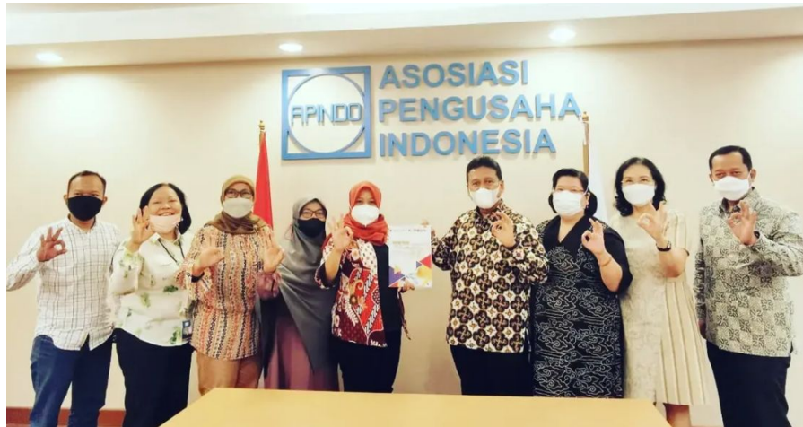
APINDO receives Hearings of the Joint Committee for Regulations Strengthening & Corporate Reporting on OSH. The discussion discussed strengthening OSH in the Workplace for the Prevention of Work Accidents (15 March 2022)