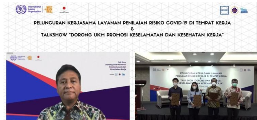
ILO, Apindo and PHRI to Enhance COVID-19 Prevention Measures in Hospitality Industry and SMEs (January 2022)