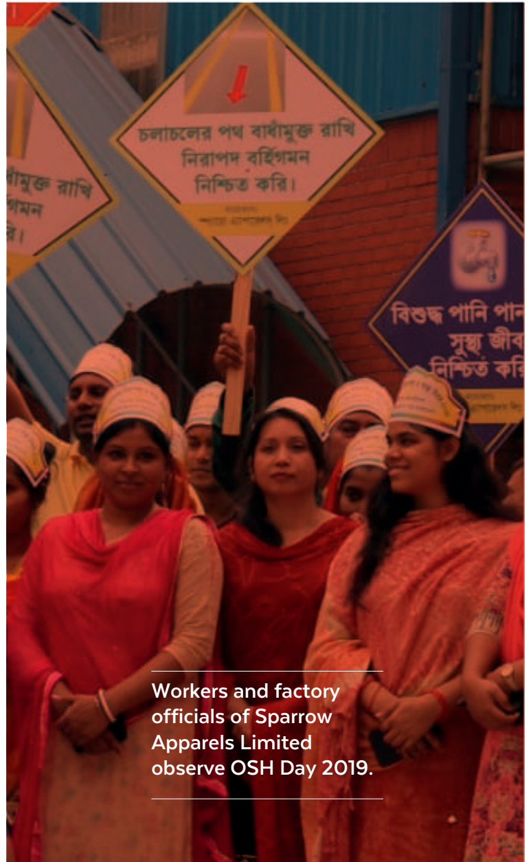
Workers and factory officials of Sparrow Apparels Limited observe OSH Day 2019.